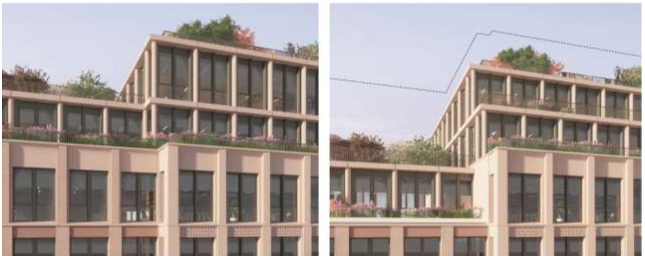
Figure 4: CGI of the previously proposed building (to the left) and the revised proposed building (to the right) as seen from 10 Epworth Street