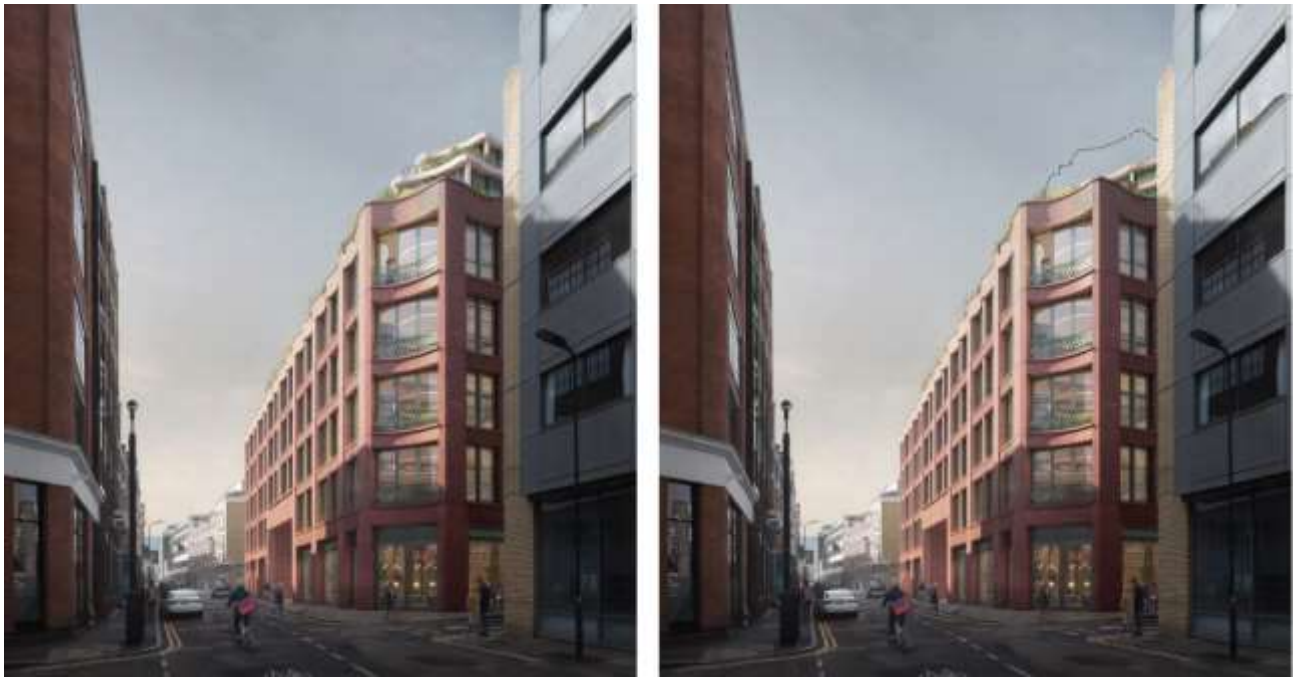
Figure 3: CGI of the previously proposed building (to the left) and the revised proposed building (to the right) looking south along Paul Street