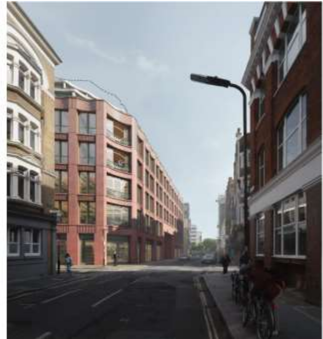
Figure 2: CGI of the previously proposed building (to the left) and the revised proposed building (to the right) looking north along Paul Street