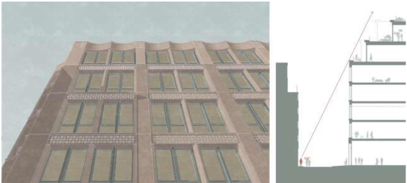
Figure 8: CGI of the 'sightline' from the pavement of the proposed building as seen from 20 Clere Street