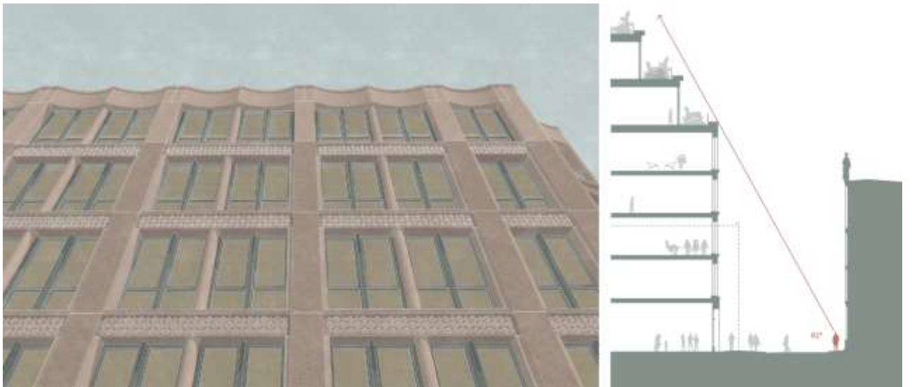
Figure 6: CGI of the 'sightline' from the pavement of the proposed building as seen from 24 Epworth Street