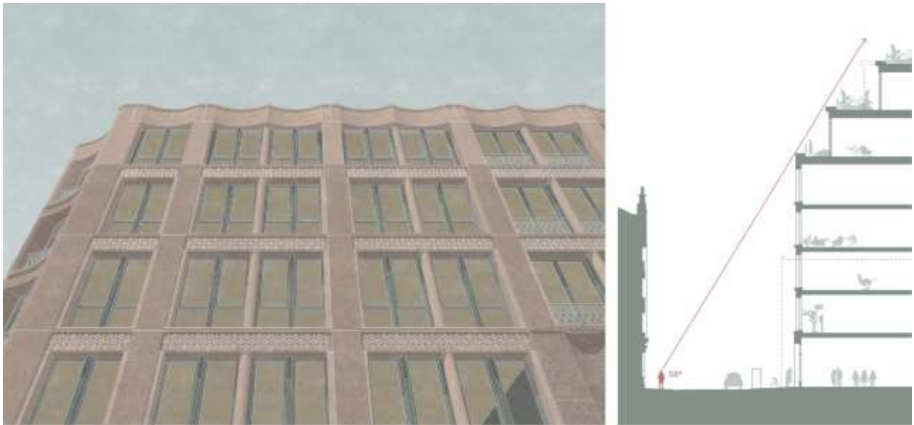
Figure 7: CGI of the 'sightline' from the pavement of the proposed building as seen from 28 Paul Street (The Fox)