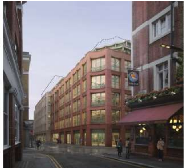
Figure 1: CGI of the previously proposed building (to the left) and the revised proposed building (to the right) looking west along Scrutton Street